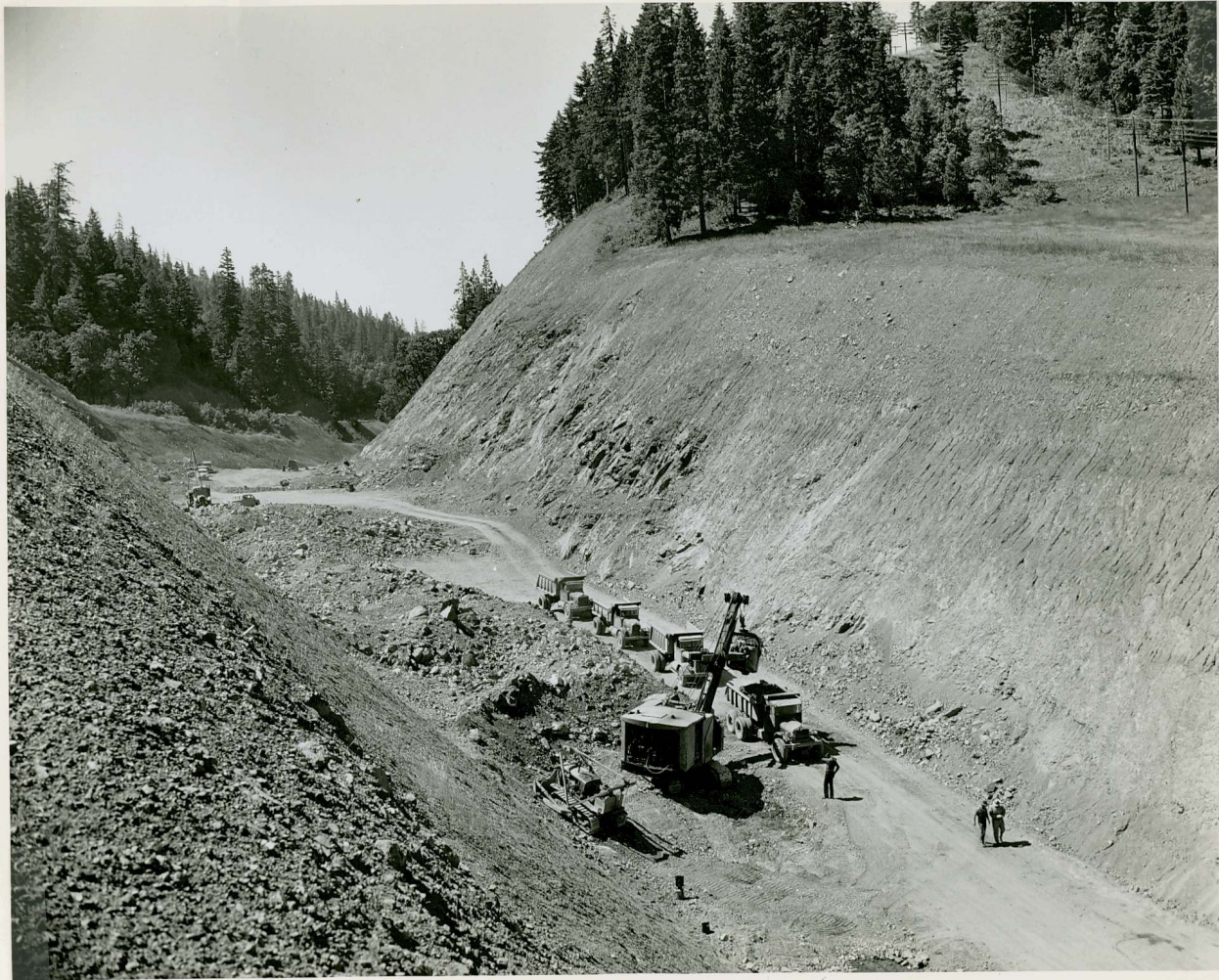
Photo 4A. South View Of AT&T 60' ROW Communication Lines In West Field At North Sexton Pass: 1940

This photograph is a south view of AT&T 60' Right-of-way (ROW) in west field at North Sexton Pass: 1941 (Maps 2, 3, 4, 5, and 6 for different locations of the ROW on both sides of Sexton Mt. Pass). The view in this picture of the AT&T and PT lines can be found on Map 2.