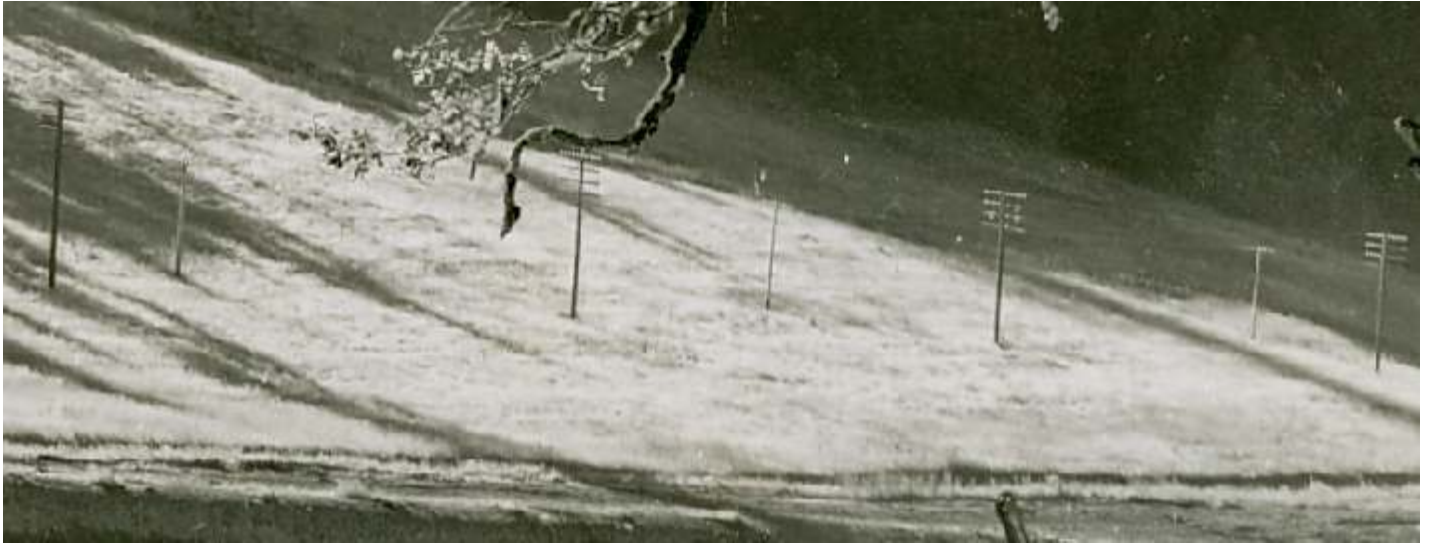
Photo 5B. AT&T & PT Communications Lines In West Field At North Sexton Pass: 1940

Photo 5B Is for a blow-up of the AT& T and PT Lines In Photo 5A