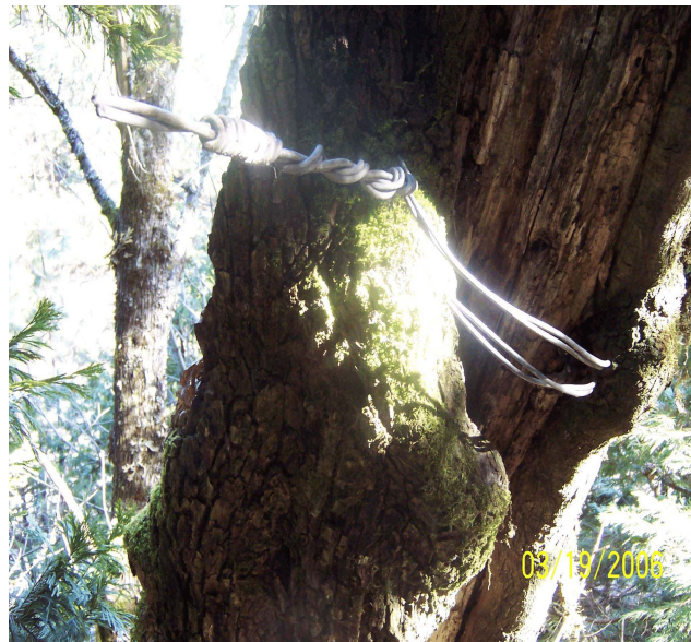
Photo 1AB. Galvanized Steel Telegraph Wire South Mt. Sexton Pass