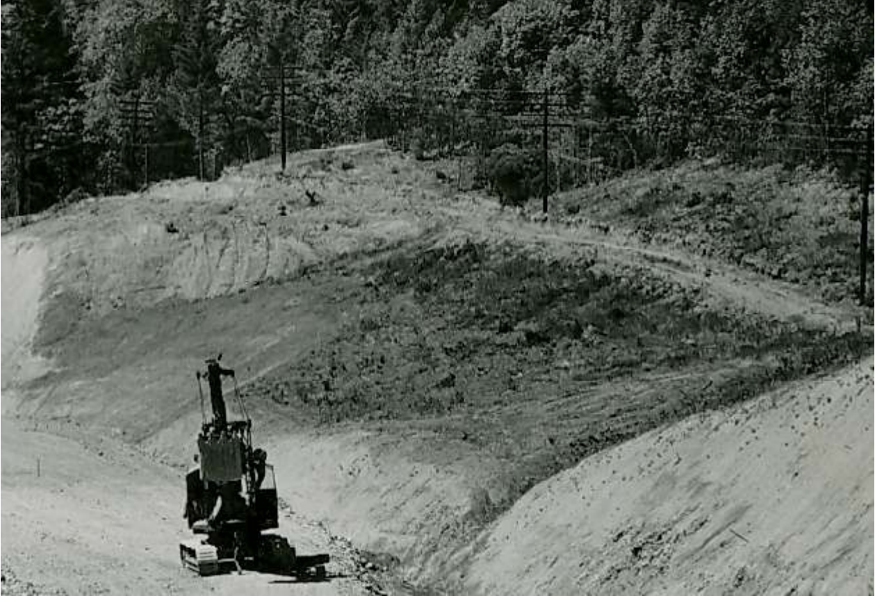
Photo 3B. AT&T & PT Communications Lines At North Sexton Pass: 1941

Photo 3B. Photo 3B Is for a blow-up of the AT& T and PT Lines In Photo 3A