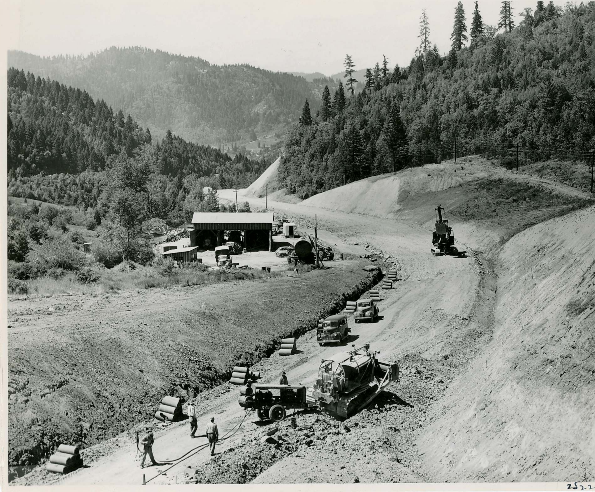
Photo 3A. Looking North From Mt. Sexton Summit At Communication Lines: 1941

This photograph is of the 1941 Pacific Highway Cut North of Mt. Sexton. Rat Creek is the drainage on the upper left of the picture and at the upper middle left is the bottom land of Sunny Valley.