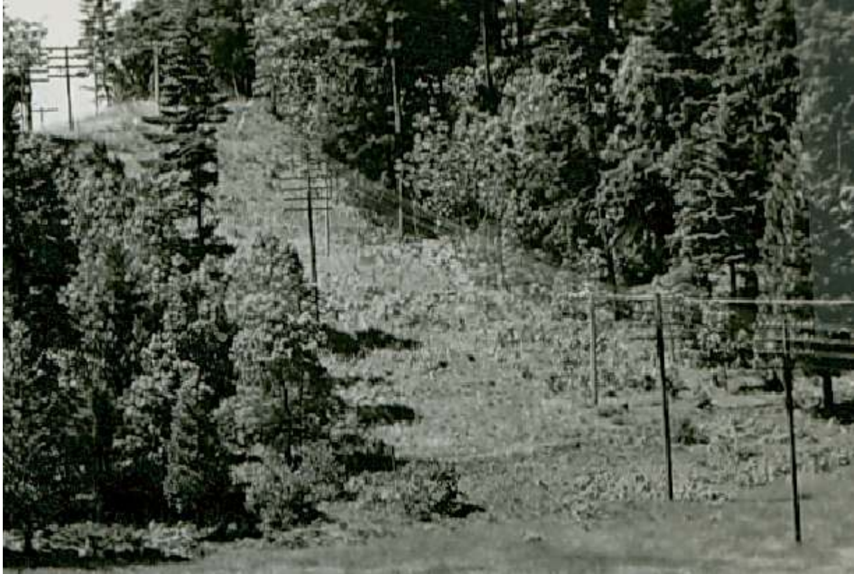
Photo 4B. AT&T & PT Communications Lines Within AT&T 60' ROW In West Field At North Sexton Pass: 1940

Photo 4B Is for a blow-up of the AT& T and PT Lines In Photo 4A