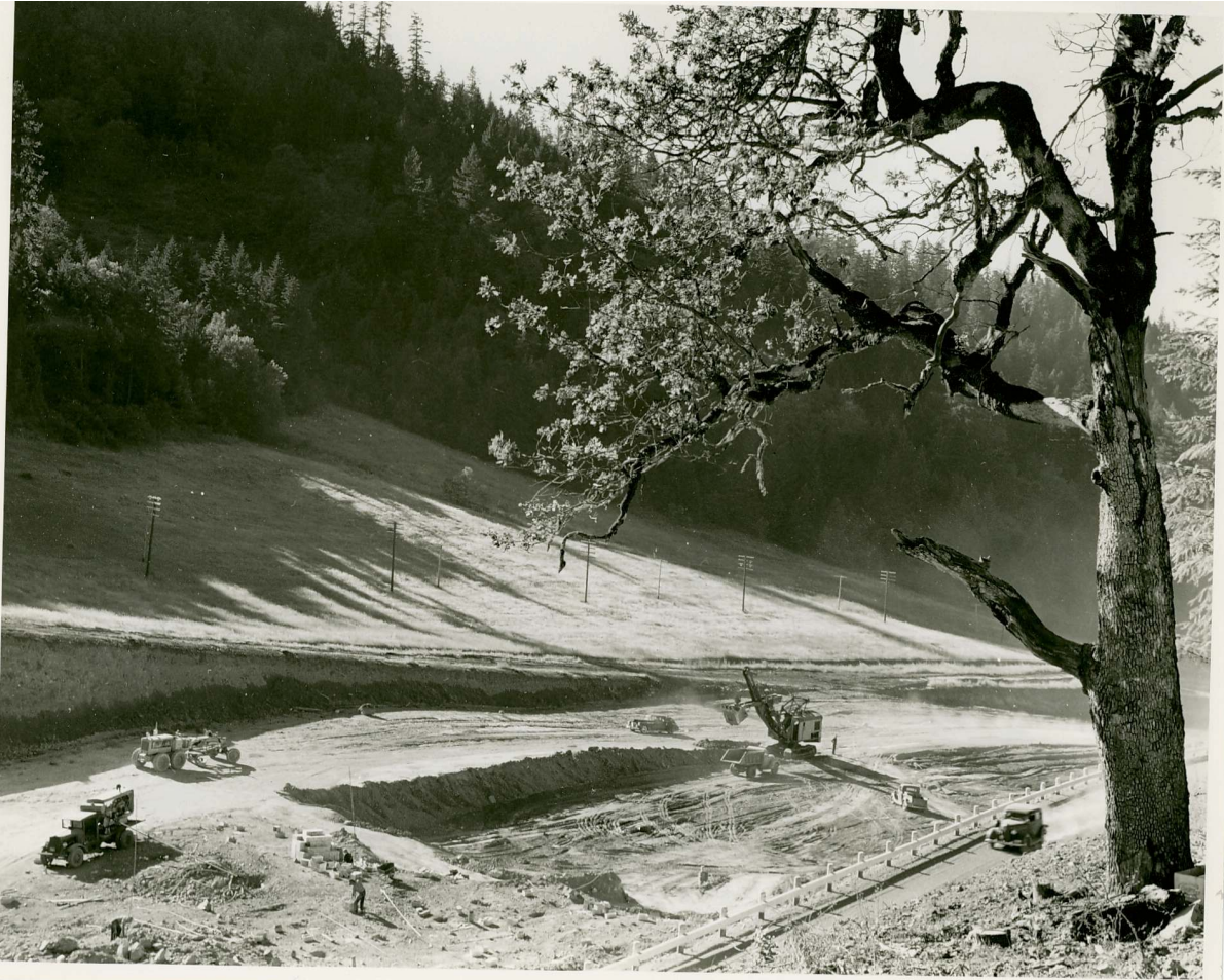
Photo 5A. West View Of AT&T 60' ROW Communication Lines In West Field At North Sexton Pass: 1940