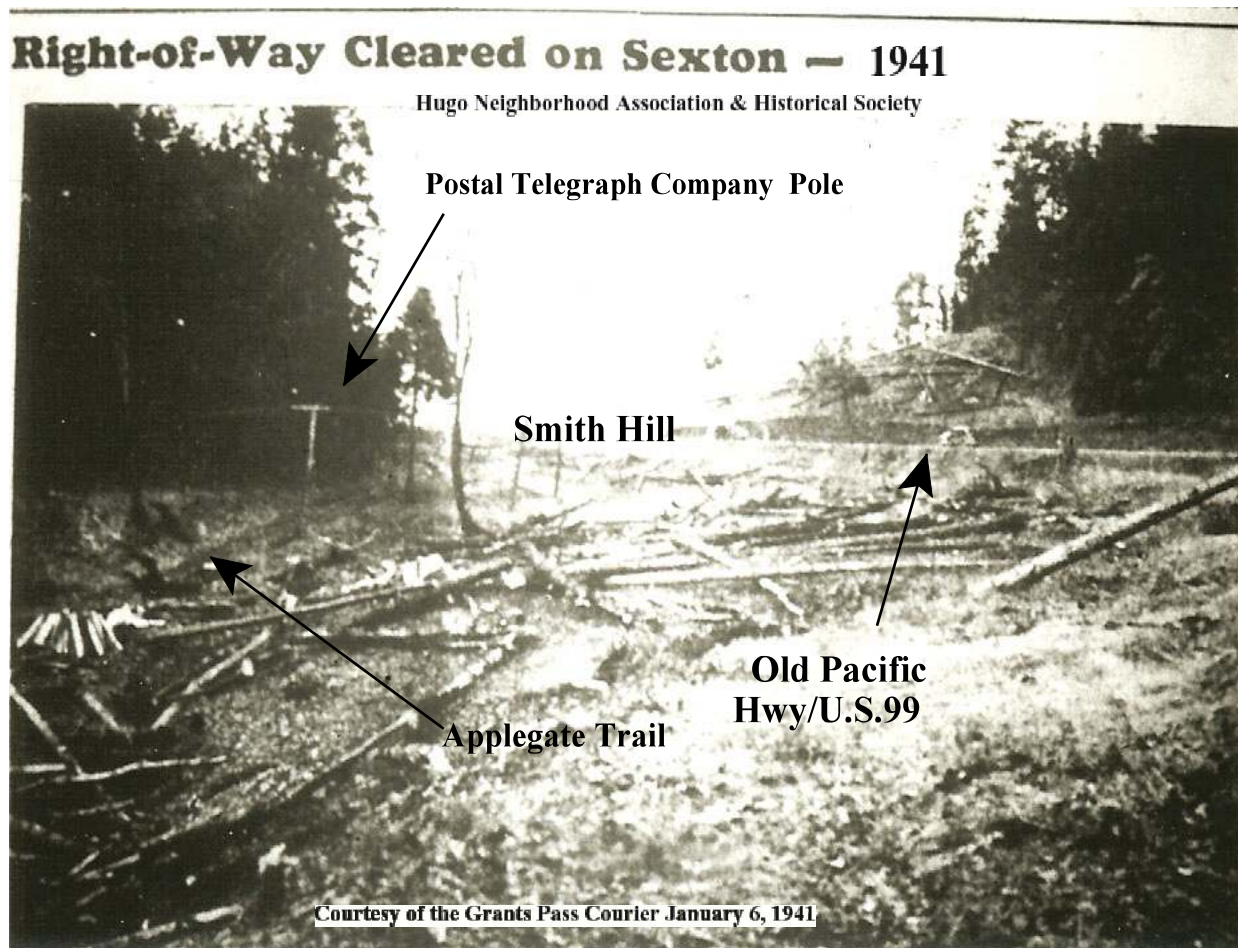
Photo 6. Right-Of-Way Cleared On Mt. Sexton Pass: 1941 Courtesy of Grants Pass Daily Courier

1941 Right-of-way Cleared on Sexton The photo is courtesy of the Grants Pass Courier with the following caption.