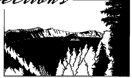
Crater Lake National Park located in Klamath County