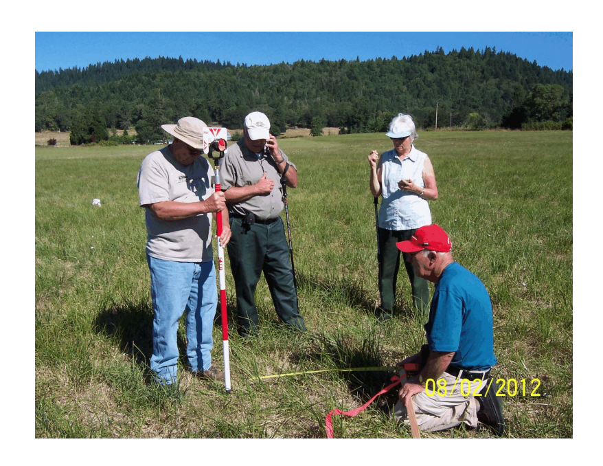
Photo 10. JA-17B: Marked With Berntsen Aluminum Survey Marker ID JA-17