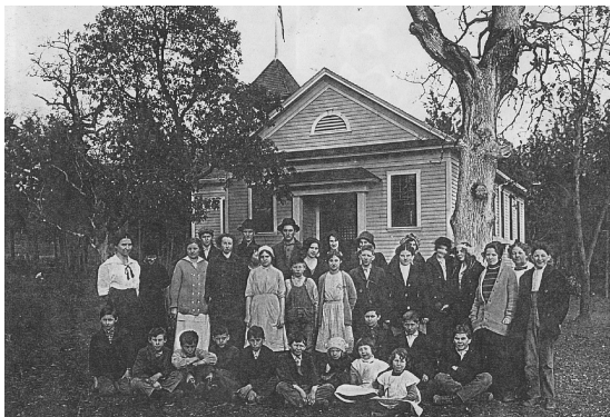
Hugo School: 1913

The Hugo Neighborhood had its roots in the Oregon Legislature's 1973 Senate Bill 100 and birth as the Hugo Citizen Advisory Committee in January 1976 (see Constitution Map). Seventeen years later in 1993 it became the Hugo Neighborhood Association, and in 2000 it reorganized into the Hugo Neighborhood Association & Historical Society. These three associations were the same evolving organization with the primary purpose of monitoring land use applications to assure local land laws were correctly applied. The Hugo Neighborhood is a land use association