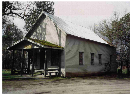
Hugo Ladies Club: 2002