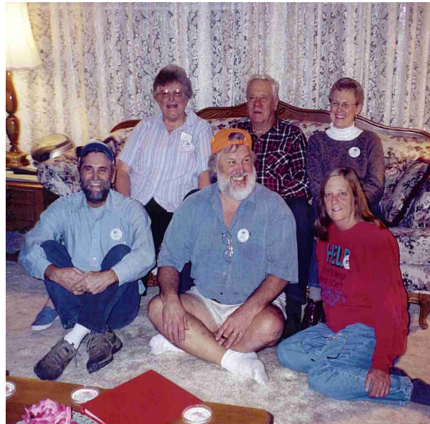
Hugo Neighborhood Association Officers: 2004

This publication is one of a series of documents published by the Hugo Neighborhood . It is designed to be shared with neighbors for the purpose of helping protect our rural quality of life by promoting an informed citizenry in decision-making. The Hugo Neighborhood is an informal nonprofit charitable and educational organization with a land use and history mission promoting the social welfare of its neighbors (Photo 1).