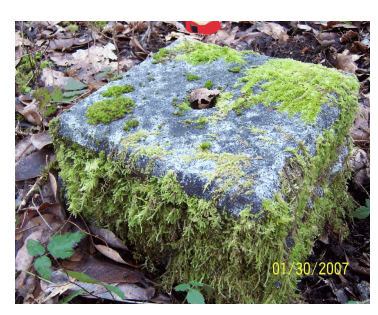
Pedestal Stone No. 1

What is the Quarry Site 's historic context? The discussion of historic context describes the history of the community where the Quarry Site is located as it relates to the history of the property. Research themes being researched include the following.