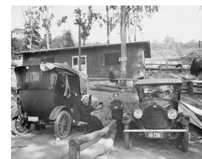
Early Auto Camp

By the late 1910s there was a change in how the remote mountains of Oregon were perceived. Instead of being viewed as obstructions that stood in the way of their ultimate destinations, say to a fishing stream, travelers now saw isolated mountain areas as escapes from their urban surroundings. Nature, therefore, became a diversion from everyday life that provided an uplifting experience.