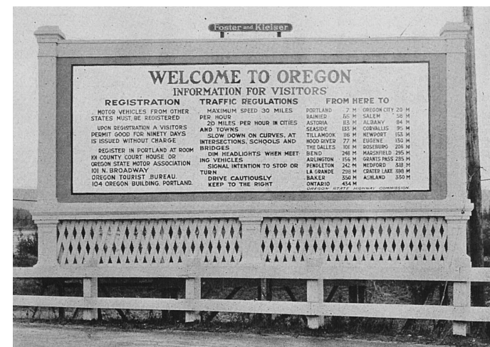
Welcome To Oregon Sign For Motorists 7 Miles From Portland: ca., late 1910s