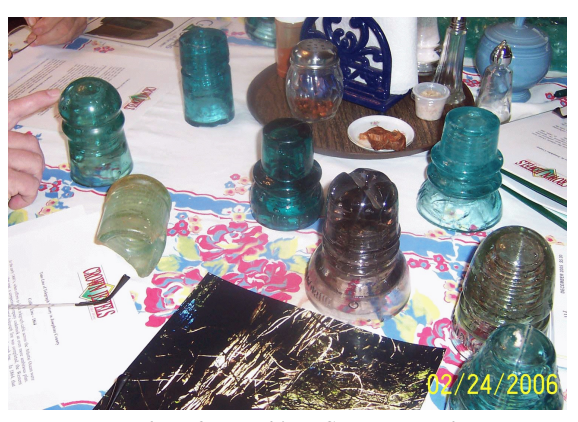
Examples of Josephine County Insulators