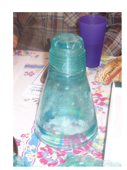
Power Insulator