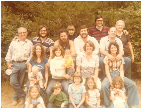
Walker - Whalen Clan: 1977