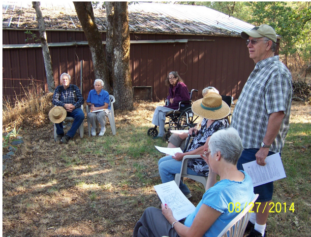
Photo 3. August 27, 2014 Graves Tour