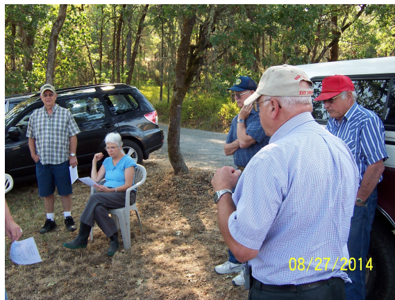
Photo 2. August 27, 2014 Graves Tour

One short of a dozen participants attended the field tour.