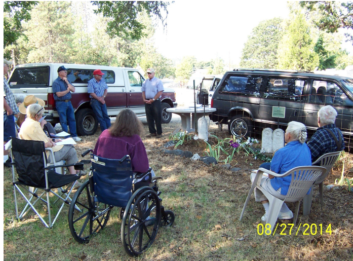
Photo 4. August 27, 2014 Graves Tour

1b) Land Use Application Action Item: Participants need to provide details of road improvement alternatives.