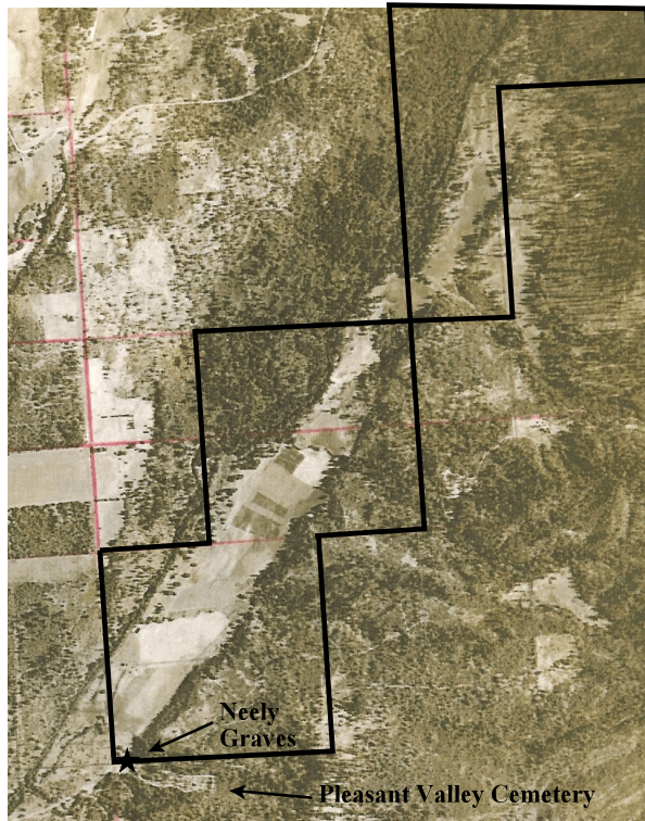
South Neely Ranch: 1895 On 1940 Aerial Photograph

Map 1. An "E. F." Neely identified on the 1895 Josephine County map was the owner of almost 600 acres where the Neely children and Trimbles' graves are located adjacent to the northern boundary of today's Pleasant Valley Cemetery (Hugo Neighborhood Association &