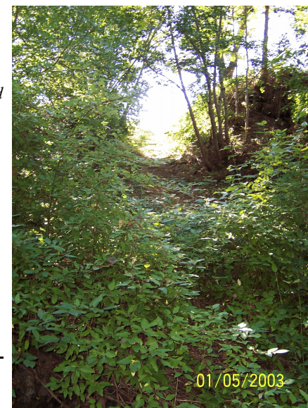
South Ford Entrance To Jumpoff Joe Creek: 09/14/2010

6. Hugo Neighborhood. September 2007. Jumpoff Joe Creek Bridge: 1924 - 2007 . Hugo, OR.