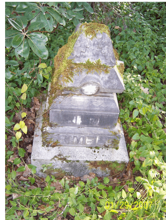
Trimble Family Plot Stone