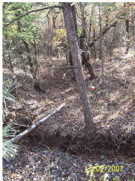
Ford Over Schoolhouse Creek: 2007

Construction started in 1869, and by 1872 the railroad was completed to Roseburg. After a long hiatus, due to shaky finances and high expenses, construction resumed in 1881. The first official train arrived in Grants Pass December 2, 1883, the same year that Tunnel No. 9, was completed. 2