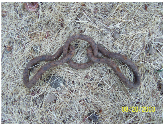
Applegate Trail Ox Yoke Chain Artifact: On Verified Class 3 Segment OR-JA-00-35-06-2- Silvestri Property