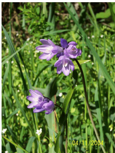
Forktooth oonkow

The Hugo wildflower web site will be used to publish wildflower information and photographs approved by the Hugo Wildflower Committee which is acting under the authority of the Hugo Neighborhood Board . Wildflowers will be published by color categories.