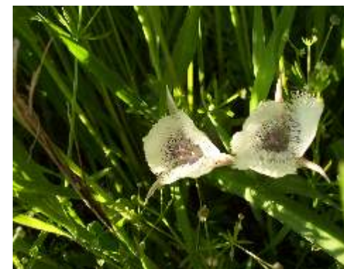
Cat's ear