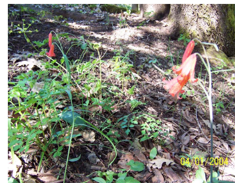
Scarlet fritillary