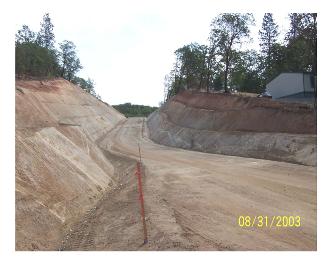
Entrance To Fir Crest Estates Off Three Pines Road

We ARE certain that there is power in numbers and feel very strongly that if the residents of Hugo want to keep their rural quality of life, we must stand up for one another whenever the opportunity arises.