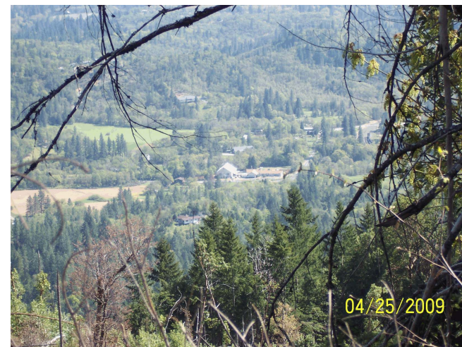
Photo 2. Old Hugo School In Center Of Photo