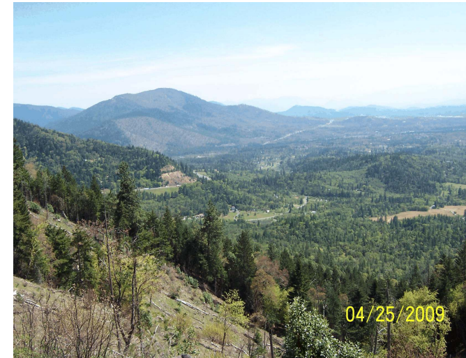
Photo 1. Walker Mt. In Background

Warning It is not advised to drive the new four-wheel drive area after the "Y" at mile 9.1 when the road is wet. The lowest elevation is on the ridge over Tunnel No. 9.