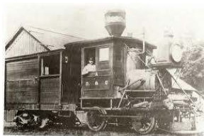
O & C Train

The first official train arrived in Grants Pass, Oregon on December 2, 1883. 1&2