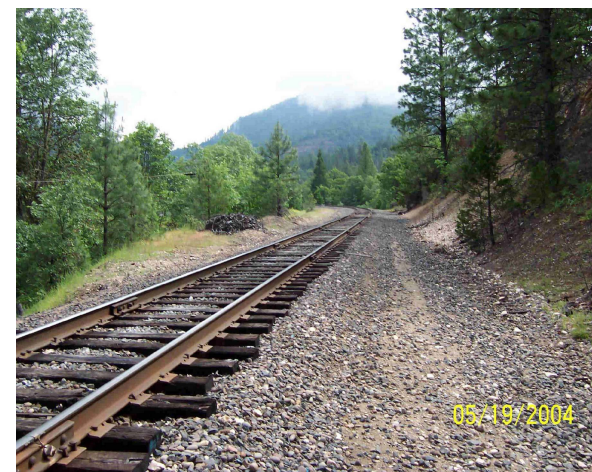
Gravel Pit Station - Railroad Mile Post 487.0