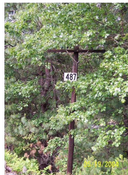
Gravel Pit Station: Railroad Mile Post 487.0