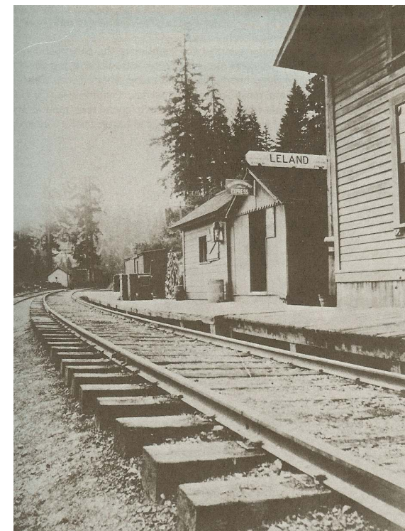
Leland Depot: ca., 1892 Mile Post 494.1