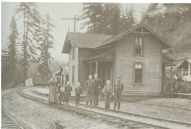
Alta Station: 1883; Leland Station: 1898

The first rail out of Portland was laid in 1869 and by December, 1872, the tracks were completed to Roseburg. Construction of the O & C Railroad was resumed from Roseburg in 1881. Grave Creek Tunnel, better known in later years as Tunnel No. 9, was completed north of Hugo July 4. The first official train arrived in Grants Pass December 2, 1883. 1&2