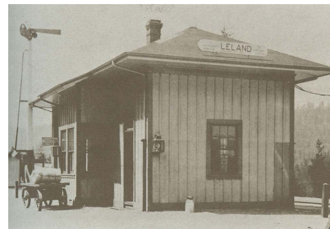
New Leland Station: January 27, 1910 Mile Post 494.1