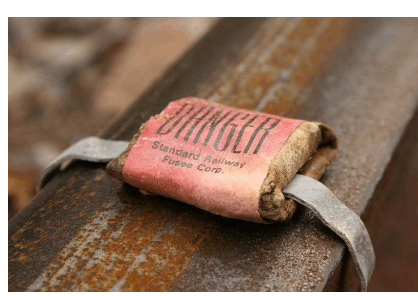
Torpedo On Rail

A Railway Detonator (called a torpedo in North America) is a device used to make a loud sound as a warning signal train drivers. The detonator is the size of a large coin with two lead straps, one on each side.