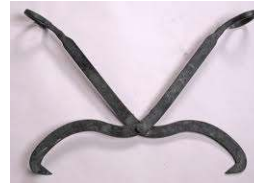
Photo 2. Tie Tongs

Spike Maul or Spike Driver A sledge hammer, but designed with a longer, slimmer head to specifically seat spikes up against a section of rail (Photo 3).