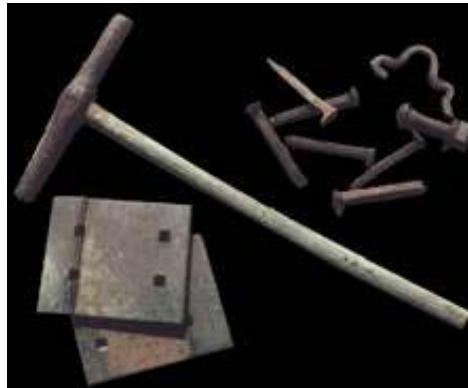
Photo 3. Spike Maul or Driver

Track Bolt Wrench is a hand tool (Photo 4) with an enclosed opening that grips the faces of the bolt or nut.