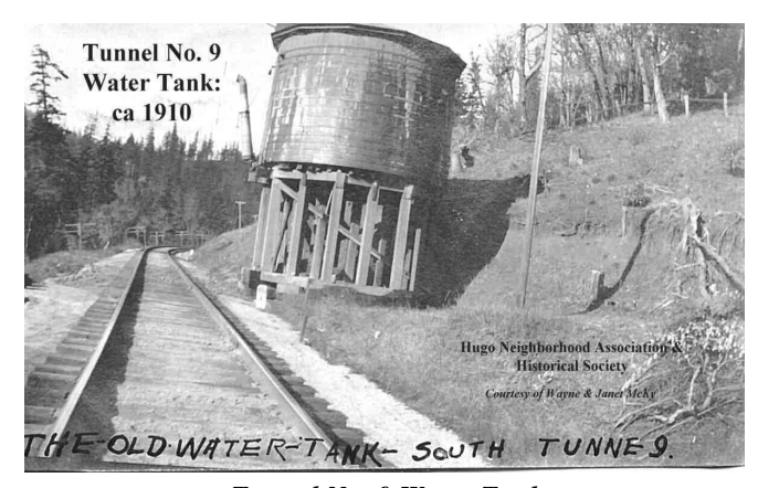
Tunnel No. 9 Water Tank