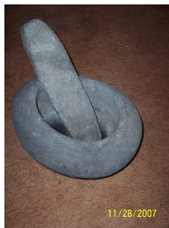
Mortar & Pestle

Mortars tend to be made of the harder materials such as granite or basalt.