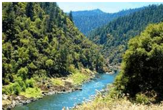
Rainie Falls On Rogue River

Takalaksi : A place near Xat'o-nkh, where the Takelma Indians came to live at some time during the Rogue Indian Wars.