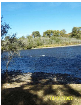
Rogue River Ford