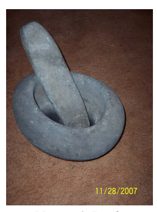
Mortar & Pestle

they would use long paddles to harvest the seeds by hitting the stalks, directing the falling seeds into shallow baskets.