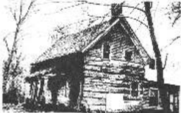
Photo 1. Old Birdseye Home

The wounded Hungry Hill troops were carried to the safety of Fort Birdseye near the present town of Rogue River. The old Birdseye home had timbers made from the old Fort Birdseye.