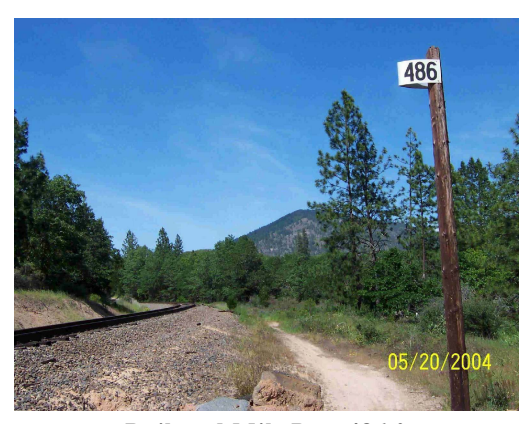
Railroad Mile Post 486.0

Southern Pacific Railroad acquired control in 1884 and the "last spike" or final ceremony in that railroad was driven at Ashland, Oregon in December 17, 1887, connecting Oregon and California.<sup>1 & 2</sup>