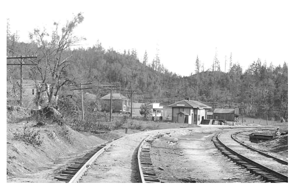
Downtown Hugo Mile Post 487.4: 1916

Contact an officer of the Hugo Neighborhood on how you can become involved in your community's land use, and/or history projects.