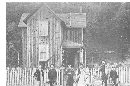
Sexton Place: 1898