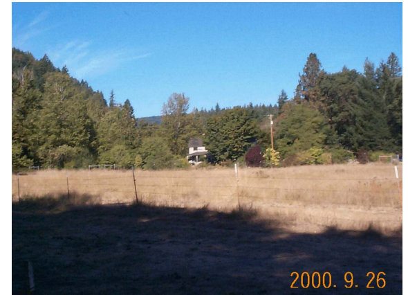
John C. Cochrane House & Farm Land: 2000

1932 The Caspescha ranch covered the good bottomland of Quartz Creek near its junction with Bummer Creek. The ranch later becomes the John C. Cochrane Quartz Creek Ranch. 4