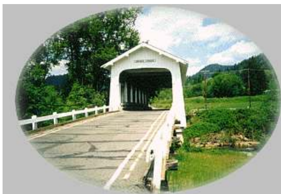
Grave Creek Bridge