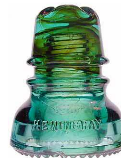
CD 208 Hemingray

The Postal Telegraph lines and AT&T long distance telephone lines were located on similar routes (perhaps 50 to 100 feet apart). They also both tended to be located in the mountains along the old stage routes (usually along side the roads).