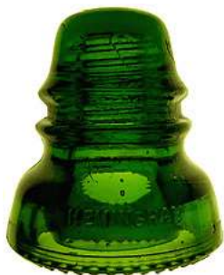
CD 152 Hemingray

AT&T built long telephone distance lines through Josephine County in the 1920s. Service from these overhead lines continued until the mid to late 1950's when the lines were replaced with buried cable. Insulators used were CD 152 Hemingrays, CD 154 Hemingrays & CD 208 Hemingrays. While the poles can still be found in the mountains, the insulators and hardware were removed by the company and taken to landfills. Howard Banks can remember seeing stacks of insulators at Dry Diggin's, a landfill just east of Grants Pass that was closed with the construction of Interstate Five in the late 1950's. 1