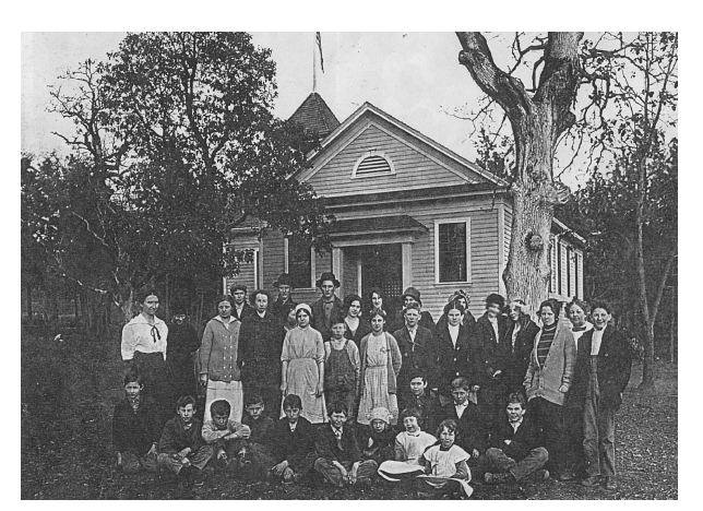
One Room Hugo School. Hugo, Oregon: 1913