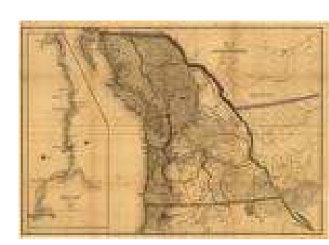
1841 Exploratory Expedition Map Of Oregon Territory

Page 120<sup>2</sup>. "On the 22d, they began their route across the Umpqua Mountains. The ascent was at first