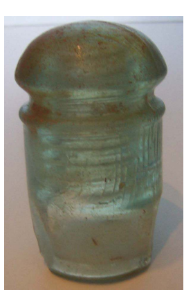
Hugo's Railroad CD 126 Blob Top

The CD 127 was an early Brookfield insulator probably made in the mid-1880s and was one of the original insulators used along the railroad in southern Oregon. They are not particularly rare in the aqua color as they were made in the millions.