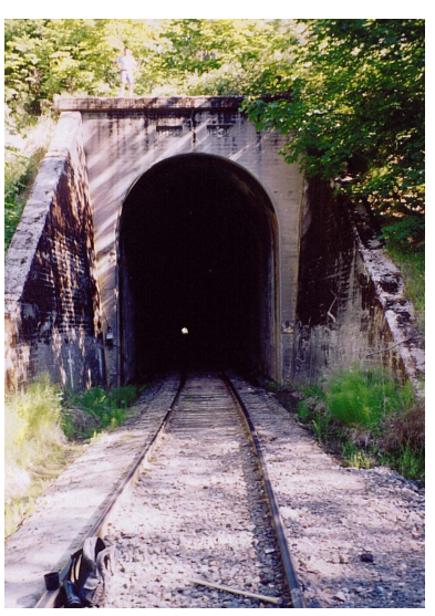
Tunnel No. 9

The telegraph line along the railroad tracks has used a variety of wire: galvanized wire, copper wire, and copper-clad iron wire.