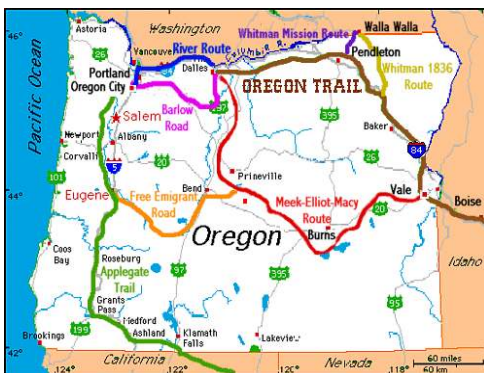
Oregon-California Trails Association Map

Hugo is blessed with a rich heritage of historic roads, rough though they were. The Trails Committee was formed by the Hugo Neighborhood to bring together all those who want to learn more about the early transportation in the area, from the casual admirer to the dedicated researcher. 1&2