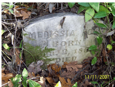
Medissa Rowe's PVC Tombstone