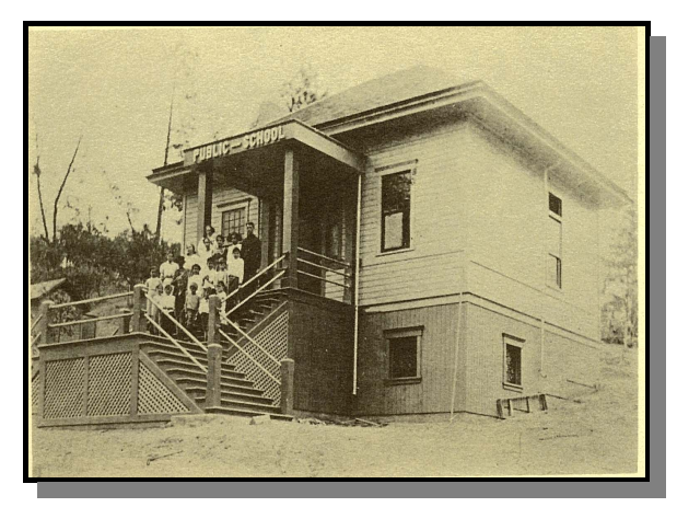
Three Pines School: 1914