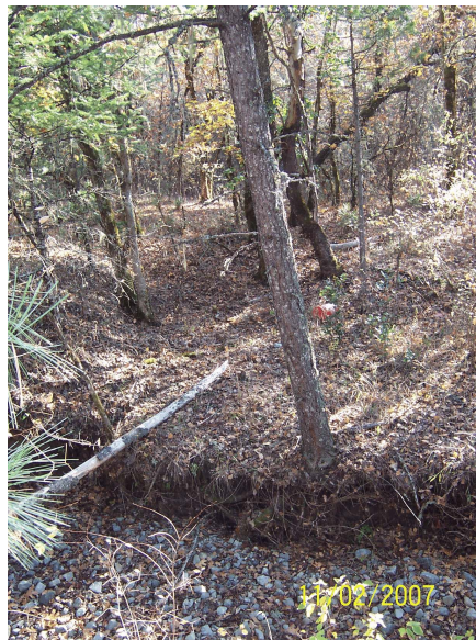
Ford Over Schoolhouse Creek: 2007

Construction started in 1869, and by 1872 the railroad was completed to Roseburg. After a long hiatus, due to shaky finances and high expenses, construction resumed in 1881. The first official train arrived in Grants Pass December 2, 1883, the same year that Tunnel No. 9, was completed. 2