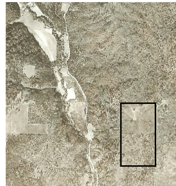
Thomas Overton's 1896 Homestead On 1939 Aerial Photograph