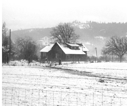
Brown's Hugo Home: 1960s

feet high. Carrol still has the old spikes that they used to climb the poles with. His uncle Ralph had been a lineman and knew what to do. They salvaged all the cross irons, copper wire, and other material from an old power line that went south from Grave Creek on the east side of Mt. Sexton to Grants Pass (i.e., the Placer Divide line that came down Jack Creek to Winona). They got the materials and moved them by horse and wagon to the Hugo side and that was what they used to develop the new line." 1