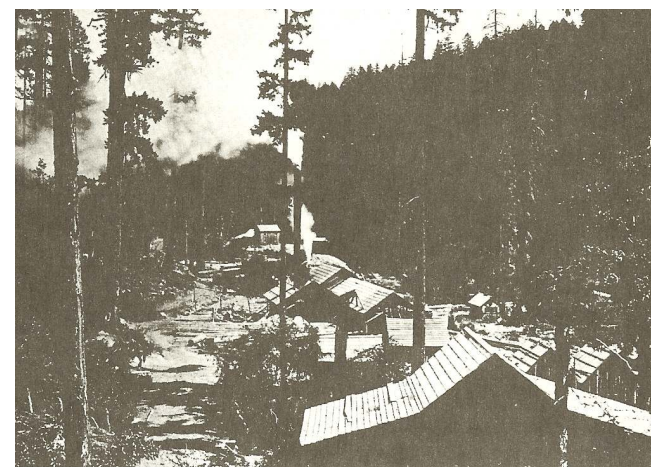
Mountain Lumber Mill: ca., 1908 - 1913 2