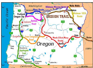
Oregon-California Trails Association Map

On June 20, 1846, The South Road Company organized again to explore and find a trail from the Willamette Valley over the Cascade Mountains to near Ft. Hall on the Snake River, which was suitable for covered wagons.