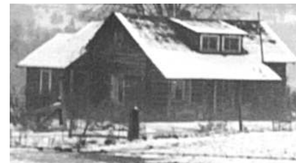
Brown's Old Hugo Home: in 1960s It was started in 1926