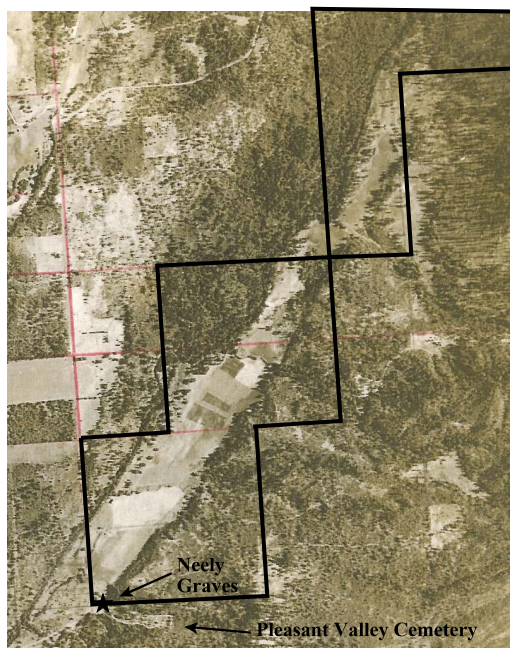
South Neely Ranch: 1895 On 1940 Aerial Photograph