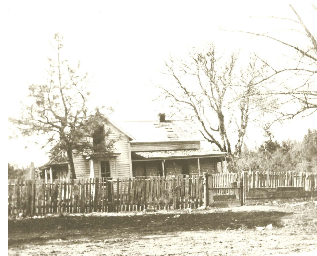
McCaslin Home Along Applegate Trail: 1897