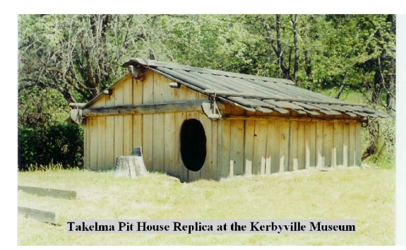
Takelma Pit House Replica At the Kerbyville Museum: 2003

Native inhabitants date back as far as 10,000 years ago in the Hugo area.<sup>1</sup> The Takelma Indians, or commonly named the Rogue River Indians, lived in semi-permanent villages during the winter, and then broke up into smaller bands during fall, spring and summer to hunt, fish and gather in the neighboring foothills. During their time away from their village, they lived in temporary camps in brush houses.