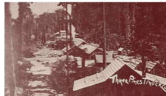
Three Pines Timber Company's Mountain Saw Mill: 1910

December 23, 2007 Updated August 7, 2011