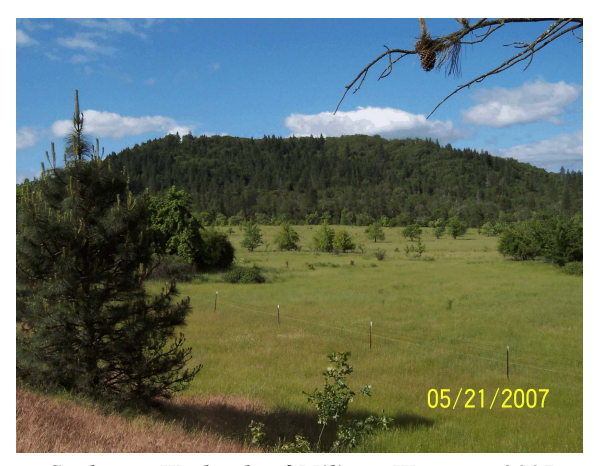
Cochrane Wetlands of Military Warrant: 2007

Natural Prairie & Pasture <sup>6-7</sup> The military patent included most of the open wetlands of what would later become part of the 240-acre J. C. Cochrane ranch. The warrant and the ranch's location had a reason: natural sub-irrigation for pasture during the winter, spring, and early summer.